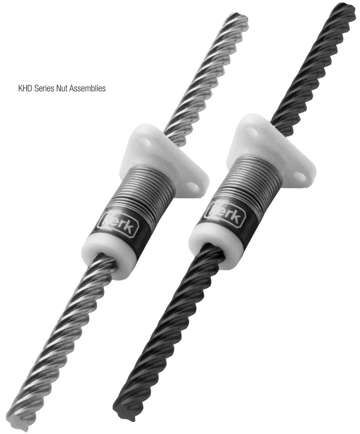
KHD Series Nut Assemblies

Eliminates the need for load compensating preload forces. The KHD Series anti-backlash assembly makes use of the Kerk patented AXIAL TAKE-UP MECHANISM (see Lead-screw Assemblies: Anti-Backlash Technologies section) to provide backlash compensation. The unique split nut with torsional take-up provides increased load capacity and axial stiffness over comparably sized ZBX units. Although the KHD offers high axial stiffness, frictional drag torque (1-3 oz.-in.) is very low. The anti-backlash mechanism in the KHD unit eliminates the need for load compensating preload forces. The assembly consists of a 303 stainless steel screw mated with a self-lubricating polyacetal nut. End machining to customer specifications and Kerkote® TFE screw coating are optional.