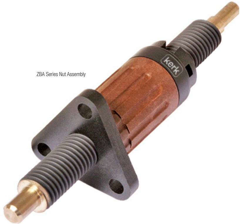
ZBA Series Nut Assembly